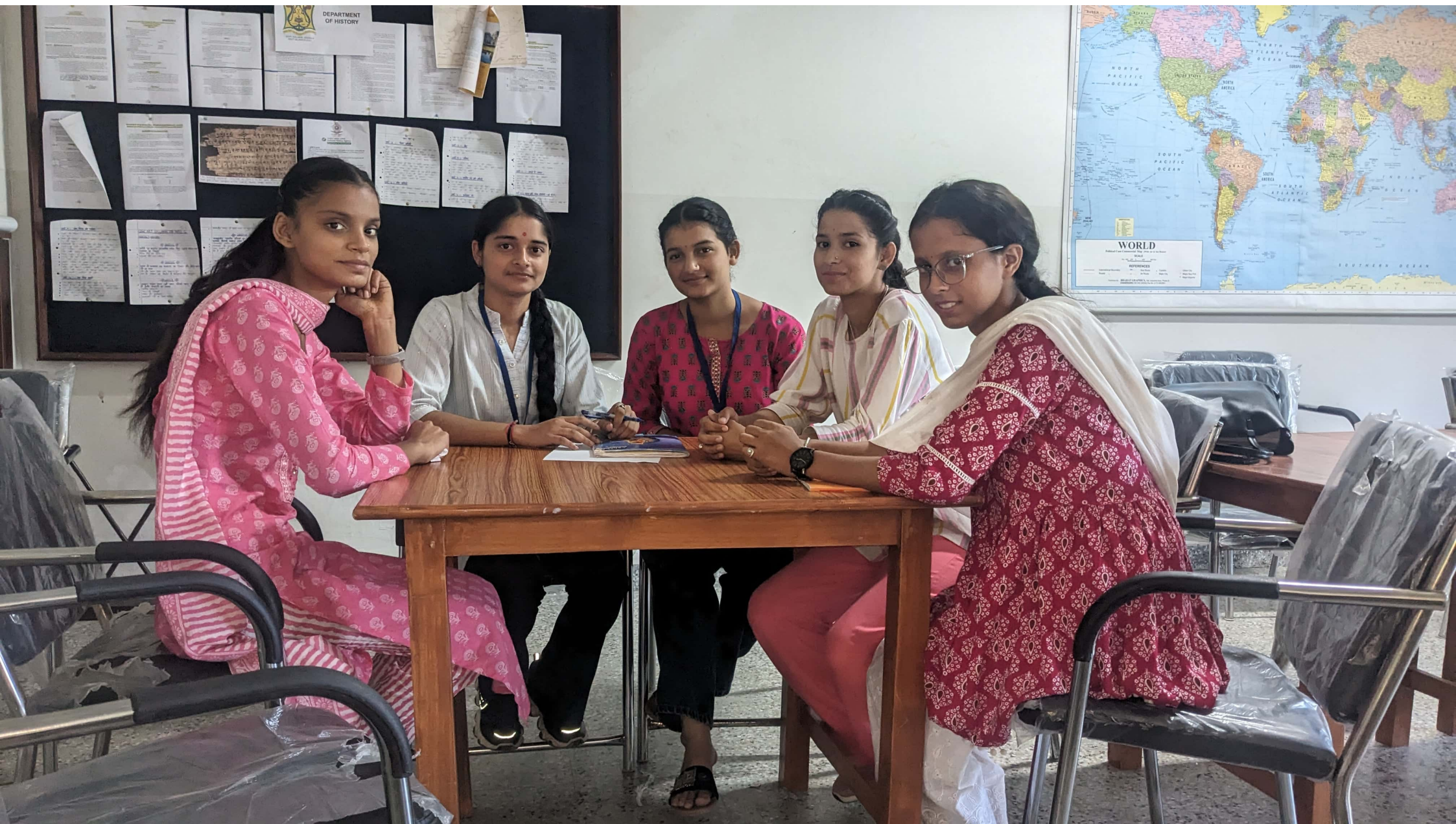
CSCA ROOM WITH FURNITURE