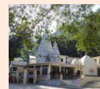
Rishi Markandeya temple

The institution is NAAC accredited and affiliated to the H.P. University vide notification 1/347/2007-HPU (Acad), and at present offers various undergraduate courses in the faculties of Science, Arts, and Commerce.