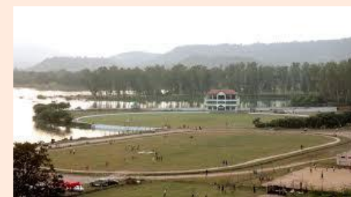
Cricket stadium, Luhnu Ground, Bilaspur