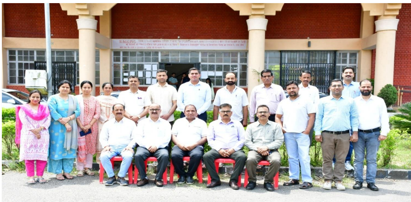
Staff - Govt. College Jukhala, District Bilaspur, H.P.